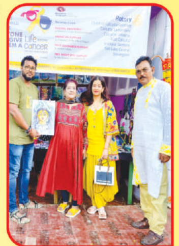
During Durga Puja, WE took active part in Maddox Square Cancer Survivors Stall where our Young Cancer Survivors painting, Handicrafts, beautiful art work, Home Décor were showcased. DG 3291 inaugurated the Stall. PRIP was also attended.