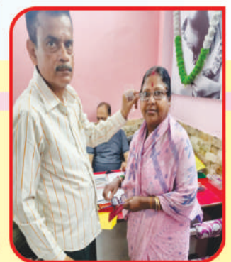
SUKHO-DRISTI - 4 , on 08th August 2025 distributed 75 Spectacles to the under privileged section of the society at Belegkata, Kolkata for healthy Vision.