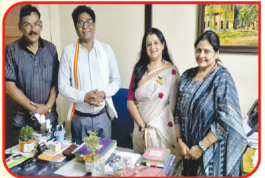
On 05th Sept, 2025 Teacher's Day, we facilitated 5 teachers & Principal, to honour their immense contribution, dedication & wisdom in shaping student's futures & building society.