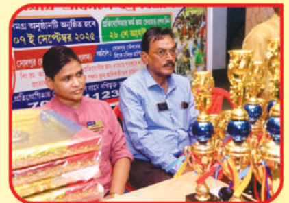
On 07th Sept, 2025 we organised All Bengal Sit & Draw Competition where more than 230 participants joined at Swami Vivekananda MuktoMancho, Sodpur, N 24 Pgs in association with Nataraj Art Group.