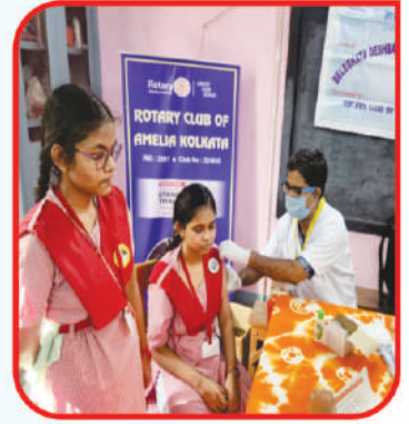
24th July 2025, 1st Cervical Cancer VACCINATION programme to our Interact Club Belegkata Deshbondhu Girls High School. 30 adolescent School Students were vaccinated with 1st dose of quadrivalent vaccine Cervavac free of cost.