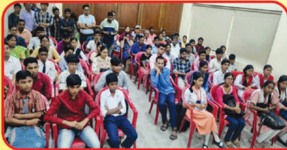
Medha Britti, a flagship project where 46 students given Scholarship to continue their higher studies. 2 Cancer Survivors, 4 Thalassemia students, 5 Medical, 4 Engineering & 4 Minority students received scholarship amount on 21st September, 2025 at Rotary Sadan, where DG 2026-27 inaugurated the programme