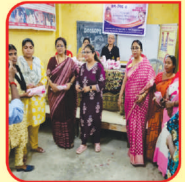
On 03rd Aug, we distributed 80 Packets Sanitary Napkins to our RCC premises-MCS Institution , Haryanvi, S 24 pgs where Women started their Vocational training Classes .