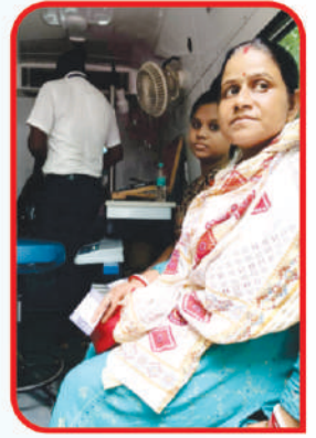
CHOKER ALO-2, on 07th Sept, 2025 74 nos beneficiaries checked up at Eye Camp with the help of Shusrut Eye Foundation & Research Centre, where 74 beneficiaries registered & checked their Eyes at Sodphur Deshbondhu Vidyapeeth, N 24 pgs in association with Nataraj Art Group.